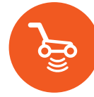
Ground Tracer & Radio detection