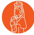
Mobile Mapper Indoor/Outdoor