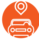
Mobile Mapper Outdoor