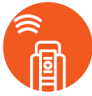
3D Laser Scanners