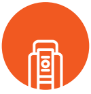
Total stations & GPS